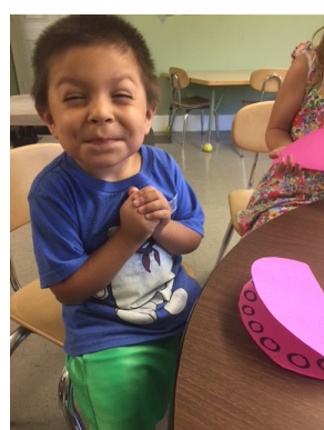
I ♥ CRAFT TIME