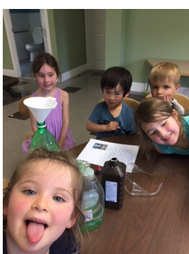
SILLY SCIENCE TIME