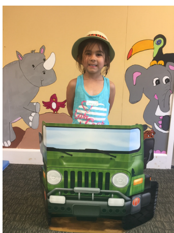
LET'S GO ON A SAFARI