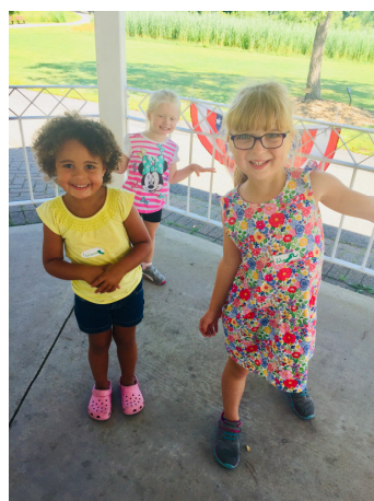
MAKING NEW FRIENDS!